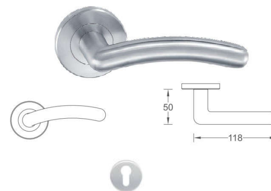
Marco Polo Stainless Steel Lever Handle on Rosette