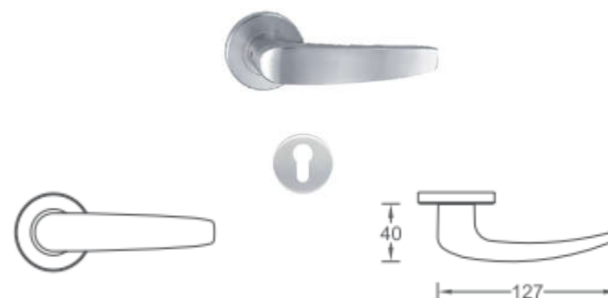
Marco Polo Stainless Steel Lever Handle on Rosette