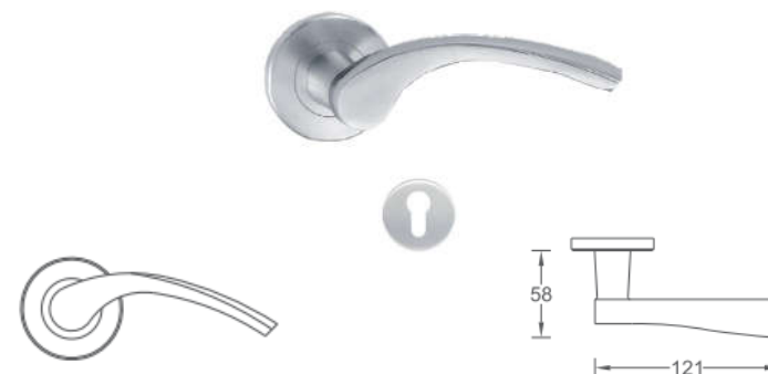
Marco Polo Stainless Steel Lever Handle on Rosette