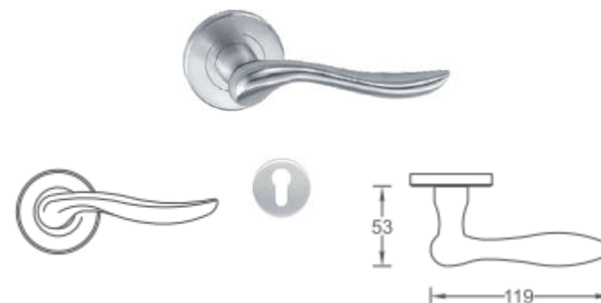
Marco Polo Stainless Steel Lever Handle on Rosette