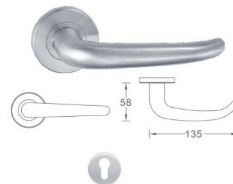
Marco Polo Stainless Steel Lever Handle on Rosette