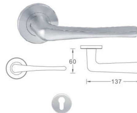
Marco Polo Stainless Steel Lever Handle on Rosette