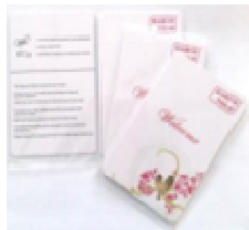
"Marco Polo" RFID Card- Mifare 1