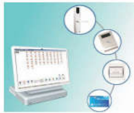
Software: Windows XP, Windows 7, Windows 8