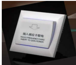
Energy Saver—"Marco Polo" Energy saver switch (30 amps) activated with Mifare card only.

Marco Polo RFID proximity card hotel lock, aluminum reader / lever handle with escutcheon design, Mifare 1 keycard, European mortise lock case, auto deadbolt, with cylinder for emergency metal key override, AAA batteries approx. for 1 year operation depends on frequency of use.