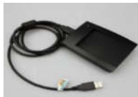
Card Reader / Issuing Device